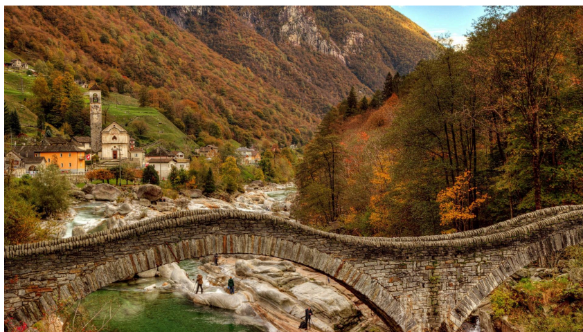
Autumn in Canton Ticino