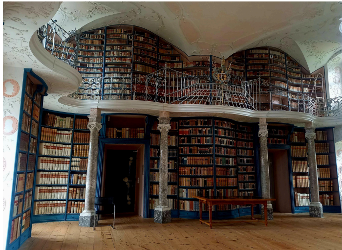
Einsiedeln Abbey Library