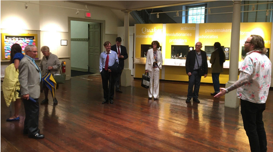
SAHS and Descendants of Swiss Settlers members enjoying a tour of the Arch Street Meeting House.